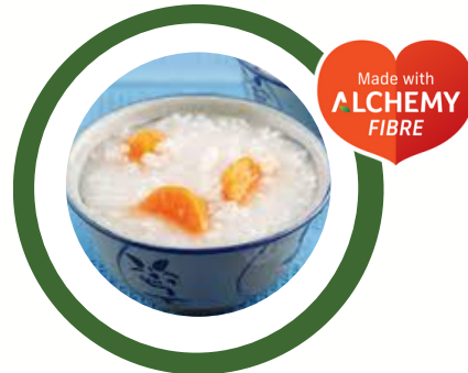
Add on Sweet Potato Porridge with Alchemy Fibre™ $1.09(w/GST) per pax