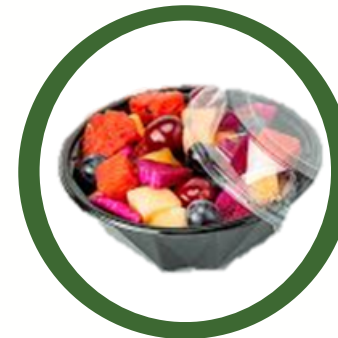
Add on Freshly cut assorted Fruit Bowl $5.86 (w/GST) per pax