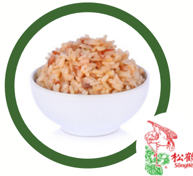
Add on SongHe (80/20) Brown Rice $1.31(w/GST) per pax