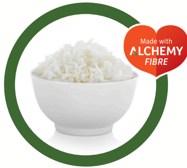
Add on White Jasmine Rice with Alchemy Fibre™ $1.09 (w/GST) per pax