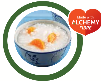
Add on Sweet Potato Porridge with Alchemy Fibre™ $1.09 (w/GST) per pax