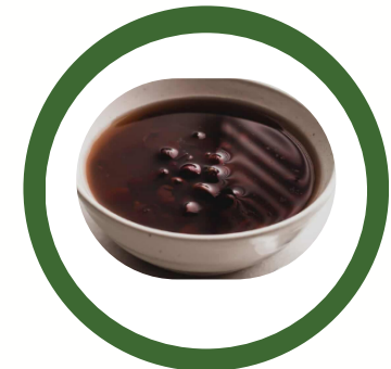
Add on Dessert $3.82 (w/GST) per pax