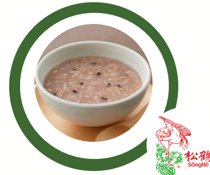
Add on SongHe (80/20) Brown Rice Porridge $1.31 (w/GST) per pax