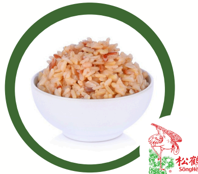
Add on SongHe (80/20) Brown Rice $1.31 (w/GST) per pax