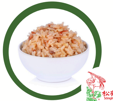
Add on SongHe (80/20) Brown Rice $1.31 (w/GST) per pax