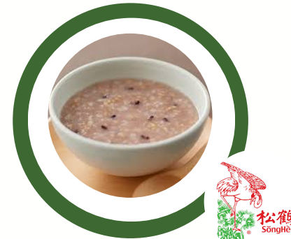
Add on SongHe (80/20) Brown Rice Porridge $1.31 (w/GST) per pax